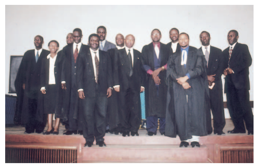
Guest of honor, judges and legal councils for the Moot Court in a group photo after the session at Nkurumah Hall, University of Dar es Salaam.

On 30th August 2003 LHRC introduced a new activity in order to work with likeminded organisations, a Moot Court. It is an activity that resembles a trial, but it is more like a play. More than 40 people participated in conducting the Moot Court; Judges, law students, private advocates and legal officers from LHRC. The moot "case" was a fictitious case of a 17 year old girl, named Chozi ("tears" in Kiswahili) who was beaten, circumcised and forced to work as a sex slave without being paid for her work. The Moot Court activity illustrated how justice is done when a young girl is being denied her basic rights as a human being.