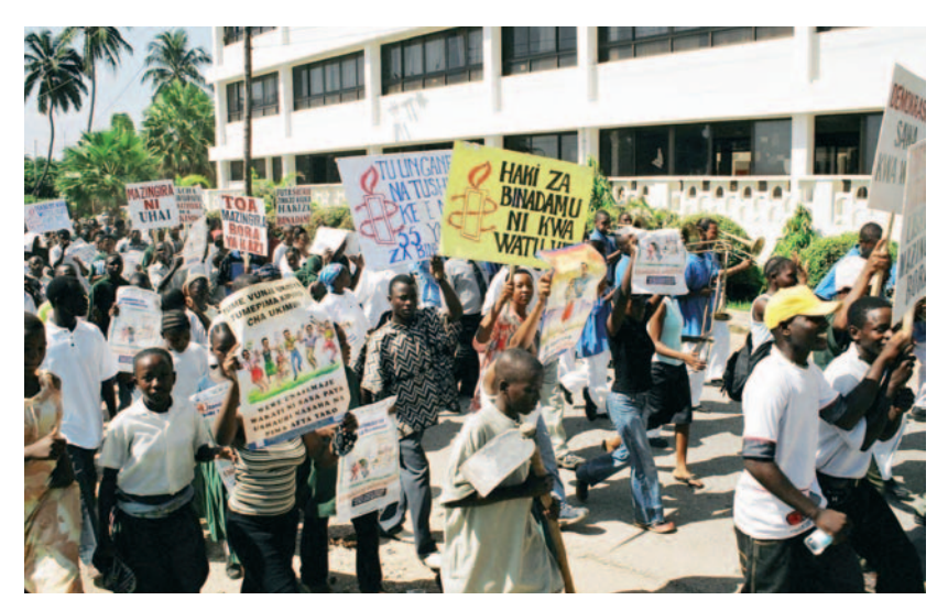
The Annual Human Rights Conference 2003 was opened with a human rights march through Dar es Salaam

The conference addressed the challenge of how to engage the wide spectrum of the society in a discussion on the impact of globalisation on people's human, economic and social rights. As a result of this discussion, a resolution was passed by the participating NGOs calling on the government to be more responsive to people's welfare when engaging in globalisation processes. The conference agreed on a special call to the government to make human rights respect a priority in all globalisation-driven undertakings in our country. Responding to that call, the Minister responsible for privatisation, Hon. Abdalla Kigoda, called LHRC to organise a forum on which he could discuss with the civil society leaders how the government is carrying out its privatisation agenda.