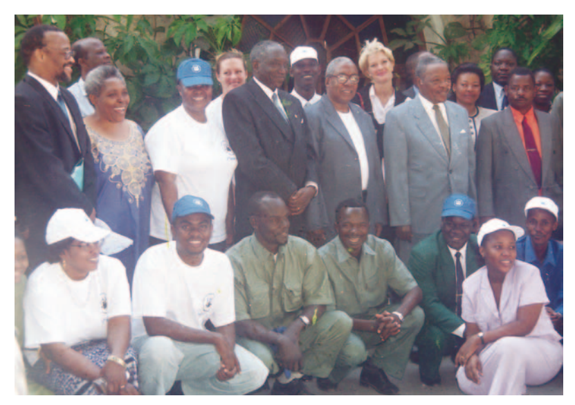
Participants of the 3rd LHRC Annual General Meeting on 8th July 2003.